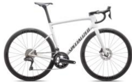
ROAD 3 Specialized Tarmac SL8 EXPERT 2025 New! Description: Full carbon frame / Carbon rims. Gear: Shimano Ultegra Di2 (2x12) 52/36T · 11/30T Sizes: 44 / 49 / 52 / 54 / 56 / 58