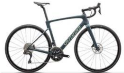
ROAD 2 Specialized Roubaix SL8 Comp 2024 Description: Carbon frame, Alloy rims. Gear: Shimano 105 Di2 (2 x 12) 50/34T · 11/36T Sizes: 49 / 52 / 54 / 56 / 58 / 61