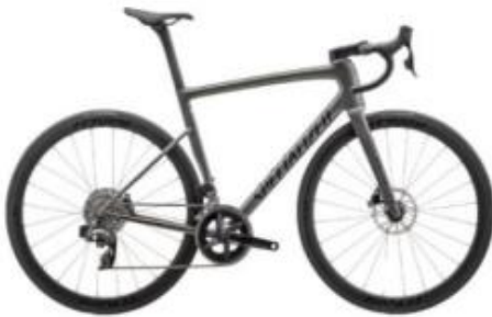
ROAD 3 Specialized Tarmac SL8 EXPERT 2024 Description: Full carbon frame / Carbon rims. Gear: SRAM RIVAL AXS (2 x 12) 48/35 · 10/36T Sizes: 49 / 52 / 54 / 56 / 58 / 61