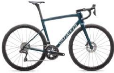
ROAD 3 Specialized Tarmac SL8 EXPERT 2025 New! Description: Full carbon frame / Carbon rims. Gear: Shimano Ultegra Di2 (2x12) 52/36T · 11/30T Sizes: 49 / 52 / 54 / 56 / 58 / 61