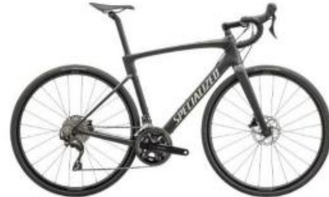
ROAD 1 Specialized Roubaix Sport 105 2024 Description: Carbon frame, Alloy rims. Gear: Shimano 105 (2 x 12) 50/34T · 11/36T Sizes: 44 / 49 / 52 / 54 / 56 / 58 / 61