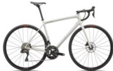
ROAD 2 Specialized Aethos COMP 2025 New! Description: Full carbon frame / Alloy rims. Gear: Shimano 105 Di2 (2x12) 50/34T · 11/34T Sizes: 49 / 52 / 54 / 56 / 58 / 61