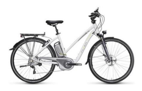
FLYER T8.1 Description: Shimano Nexus 8 speed. 700 mm wheels.