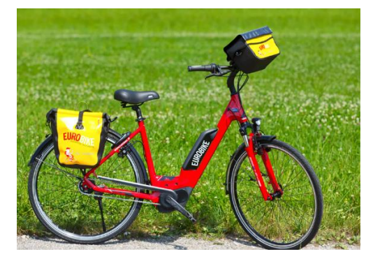
E-bike Unisex €285

The advantage of a cycling safari is that because you have a map and route details, you can enjoy each day's cycle at your own pace. To get the most out of your holiday we would recommend that you do take a few practice rides before this tour. To get the most out of your holiday we would recommend that you do take a few practice rides before this tour. There are a few short ascents that can also be conquered by pushing the bike. You cycle mostly on wonderful cycle paths and small side roads – you are on main roads only for short distances. The roads are mostly asphalted and there are some longer passages on good nature paths.