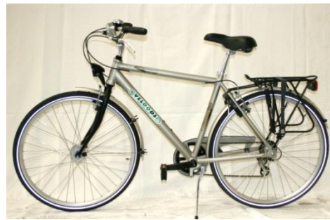
7 or 21 gear gents bike