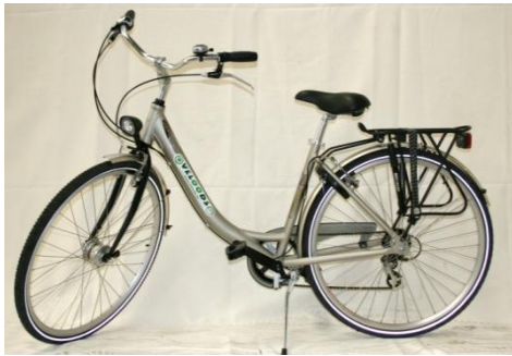
7 or 21 gear ladies bike

Bike rental is not automatically included in the tour price but can of course be organized.