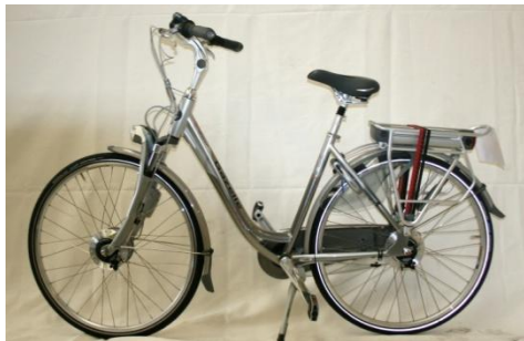
E - Bike