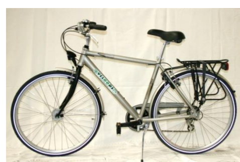
7 or 21 gear gents bike