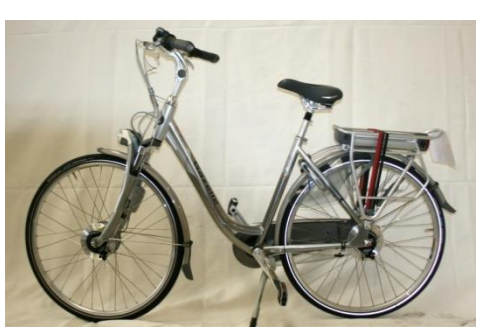
E - Bike