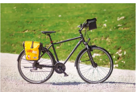
Bike PLUS with crossbar, €185