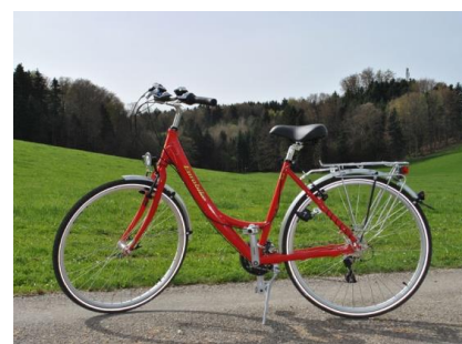
Unisex touring bike, €110