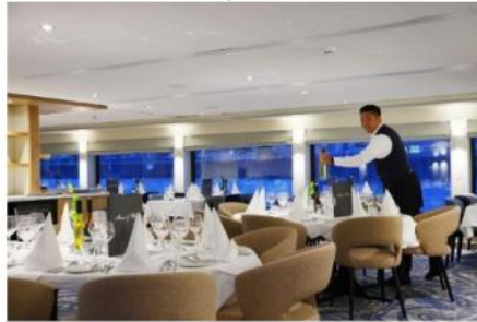
Lisabelle / Restaurant