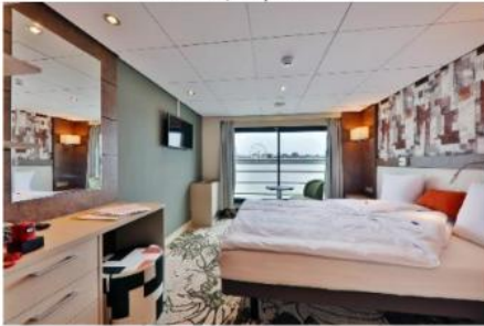
Lisabelle / Superior