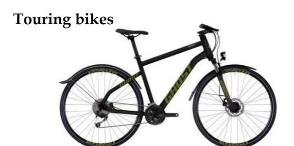
GHOST Square Cross X male Sizes: S / M / L / XL

Description: 24 speed, disc brakes, 28" wheels and rear