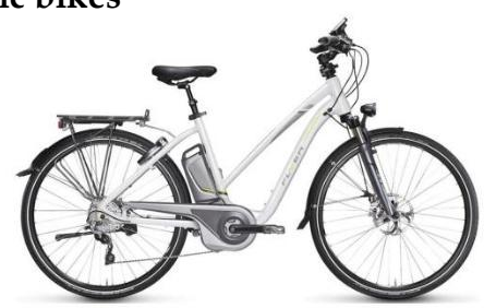
FLYER T8.1 Description: Shimano Nexus 8 speed. 700 mm wheels.