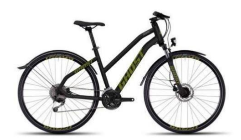
GHOST Square Cross X female Sizes: XS / S / M / L / XL

Description: 24 speed, disc brakes, 28" wheels and rear