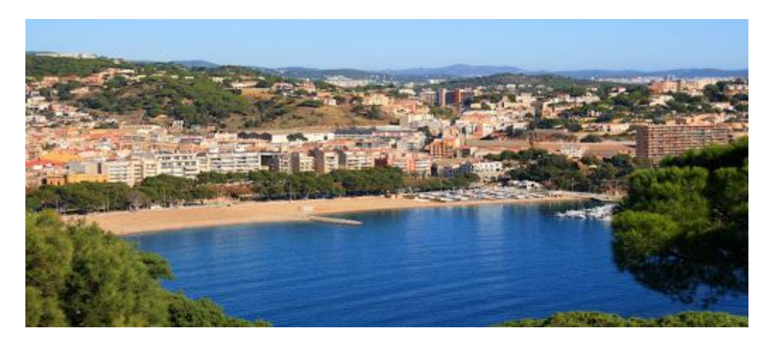
Day 3 Sant Feliu de Guixols - Calella de Palafrugell 30km 271m+

Today you'll cycle North along the coast visiting the main port town Palamós. After few kilometers you'll pass the unspoilt cove Platja de Castell, with it's Iberian settlement , before arriving in the picturesque old fishing village of Calella de Palafrugell, one of the pearls of Costa Brava. On the last section you'll cycle along the greenway called "Ruta del Tren Petit", connecting Palamós and Palafrugell , this last one with its amazing seatown on the coast.