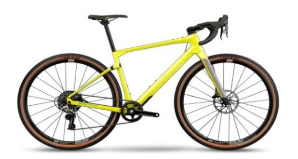
URS 01 THREE Description: Carbon frame, disc brakes SRAM Rival x1 38T / 10-42T Size: S, M, L