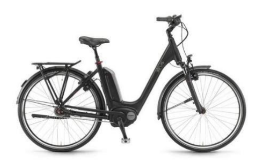
WINORA Sinus Tria Description: Shimano Nexus 7 speed. 700 mm wheels.

GHOST Square Cross X female Sizes: XS / S / M / L / XL Description: 24 speed, disc brakes, 28" wheels and rear rack. 1 Rear Pannier included.