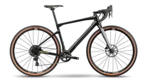
URS ONE Description: Carbon frame, disc brakes SRAM Apex x1 38T / 10-42T Size: S, M, L