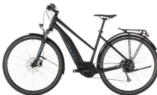
CUBE TOURING HYBRID ONE 400