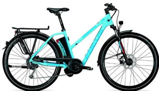
FOCUS AVENTURA 1.0