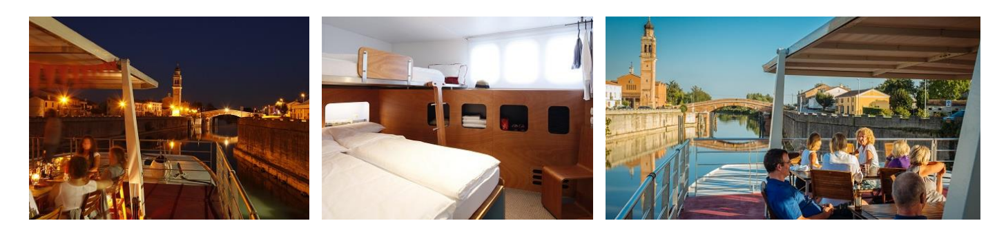
CAPACITY: 40 guests max