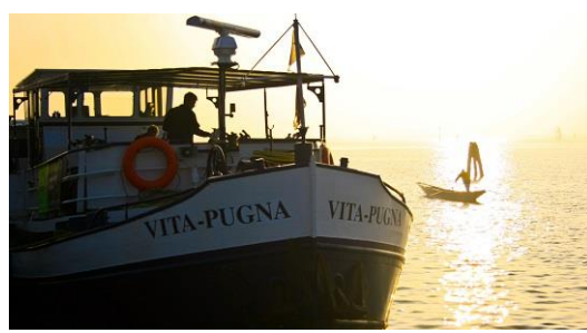
CAPACITY: 21 guests LENGTH: 36 m WIDTH: 5.4 m DRAUGHT: 1.60 m