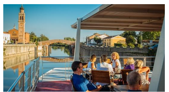
CAPACITY: 40 guests max