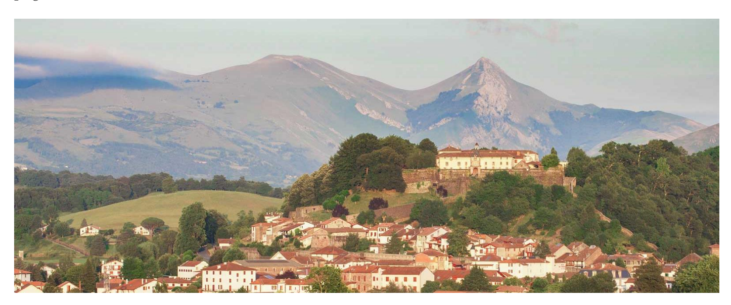
Day 5 Saint Jean Pied de Port to Itxassou / Camboles Bains 41 km / 680m elevation This stage will fit everyone. You can either continue your bike ride or if the journey of the day before has exhausted you, take a train that will take you to the next step. (1 departure in the morning and/or early afternoon) You will have time to explore the surroundings by following an itinerary specially designed for you.

After crossing the Pinodieta Pass, you will go through the market town of Espelette known for the trade of small wild horses called "Pottocks" and its famous pepper of Espelette that will truly tempt your taste buds! Then you cycle along the river Nive along small paths that snake to Saint Jean Pied-de-Port, a typical village, world famous for its Saint Jacques gateway classified by UNESCO, which, year after year, more and more pilgrims are drawn to it.