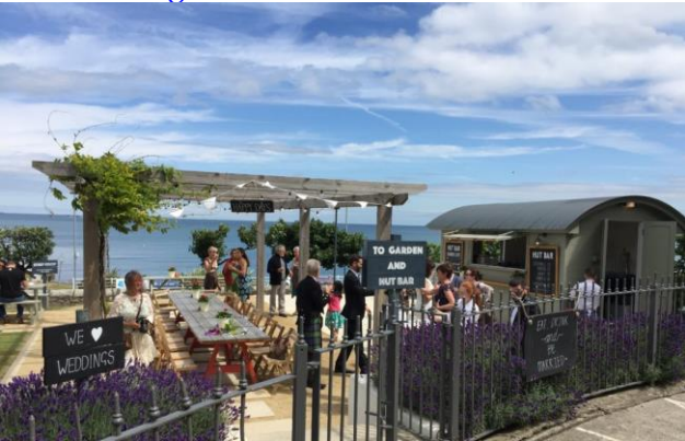
Day 1 & 7 : Dun Laoghaire, Co. Dublin The Haddington Hotel