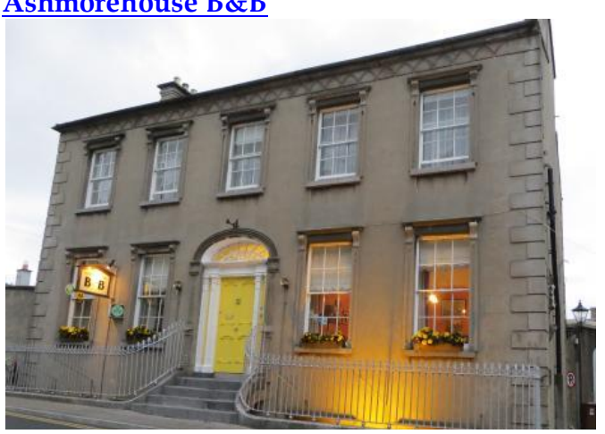
Day 6: Cashel Ashmorehouse B&B