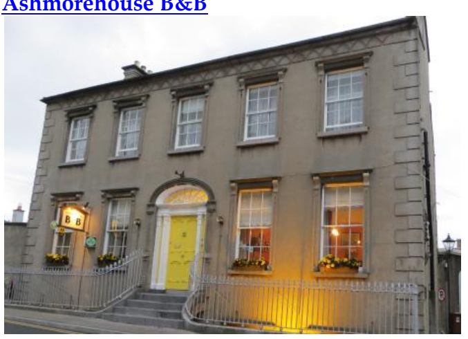
Day 6: Cashel Ashmorehouse B&B