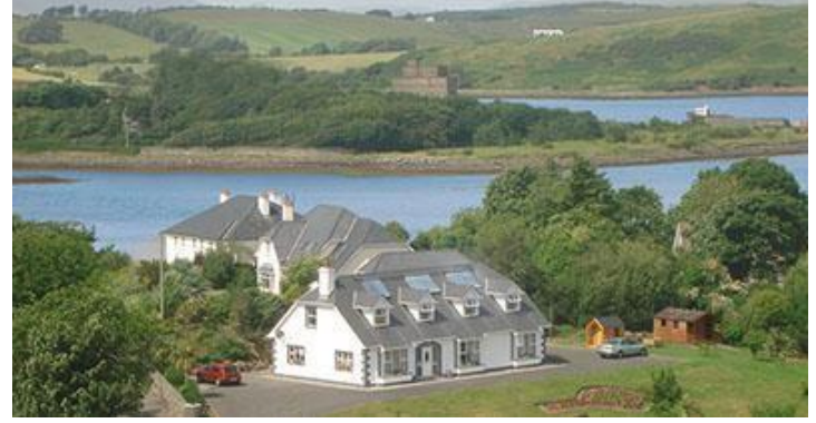
We stay down by the harbour in this attractive town Example Guesthouse : <u>Rosmo B&B</u>