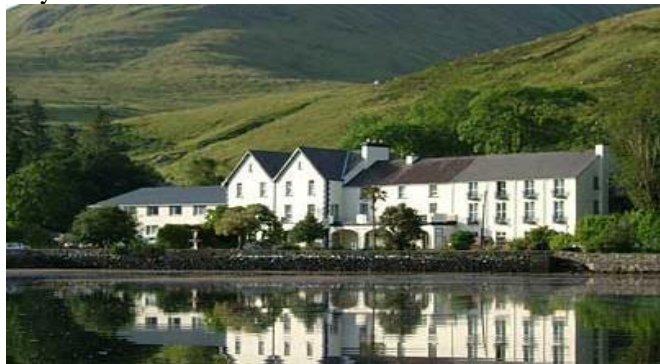
Leenane Hotel (Dinner inclusive)