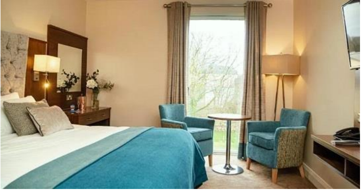
Wyatts Hotel located in the centre of Westport offers a bit of old fashioned elegance! Price on request