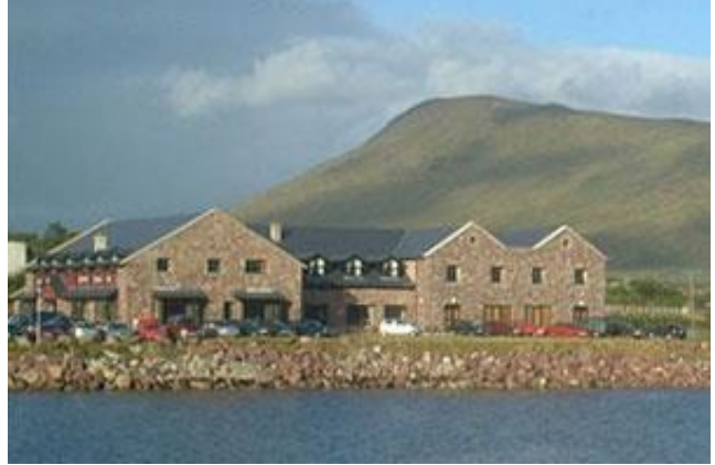
Achill Island Hotel achillislandhotel.com