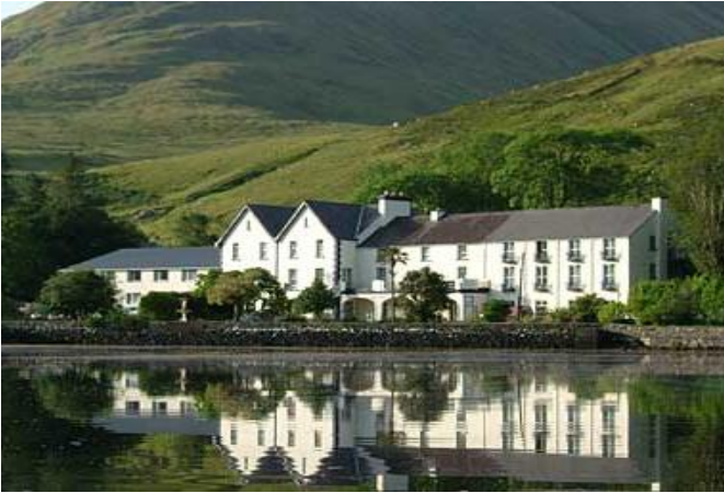
Leenane Hotel leenanehotel.com