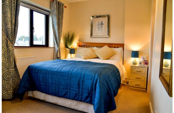
In Galway we stay in guesthouses Just a short walk into the heart of Galway but in a peaceful location! Example Guesthouse : Consilio B&B consiliobandb.com