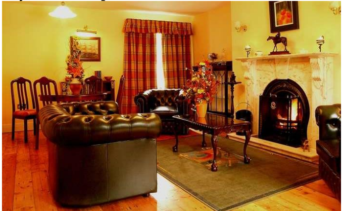
We stay down by the harbour in this attractive town Example Guesthouse: Boffin Lodge <u>www.boffinlodge.com</u>