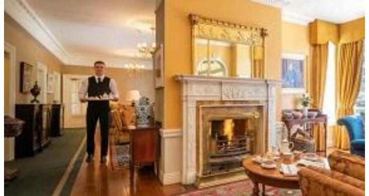
Old Ground Hotel