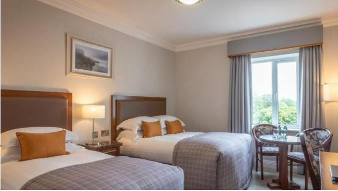
Temple Gate Hotel