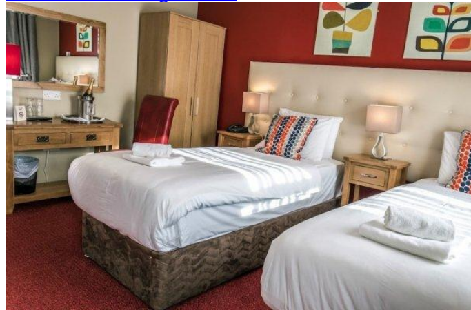
Day 4 & 5: Carlingford Mc Kevitts Village Hotel