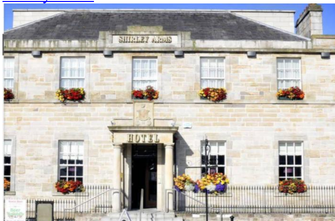
Day 3: Carrickmacross Shirley Arms