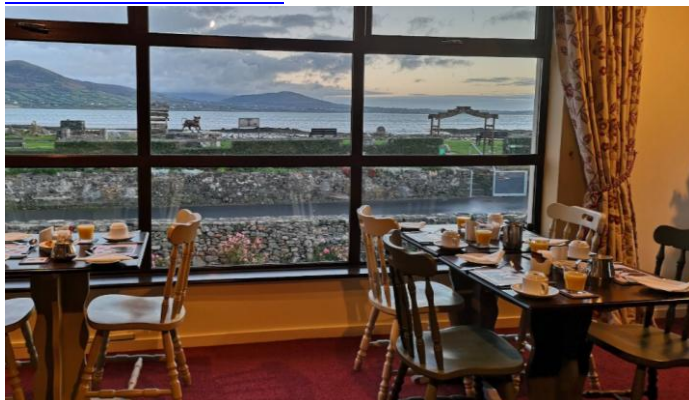
Day 4 & 5: Carlingford Shalom Guesthouse