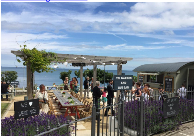
Day 1 & 7 : Dun Laoghaire, Co. Dublin The Haddington Hotel