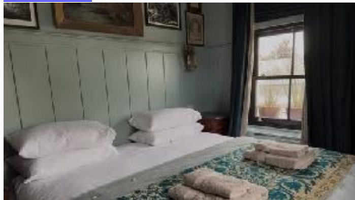
Day 3 & 4: Roundwood Coach House