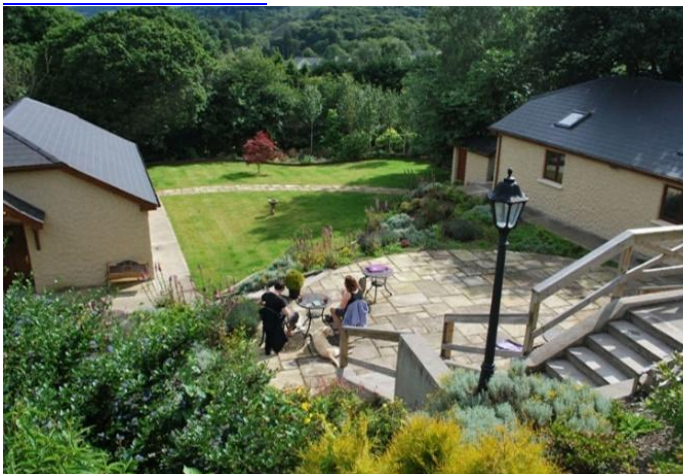
Day 4 & 5 : Laragh/Glendalough Heather House B&B