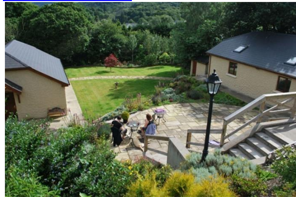
Day 5: Auhrim Meath Arms Country Inn