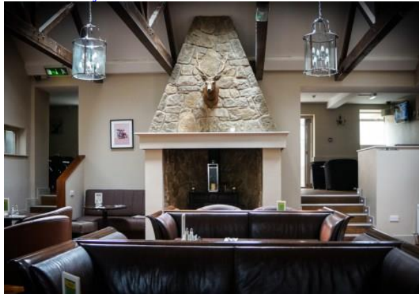
Day 3 & 4: Laragh/Glendalough Pinewood Lodge