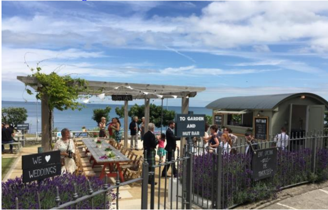
Day 1: Dun Laoghaire, Co. Dublin The Haddington Hotel