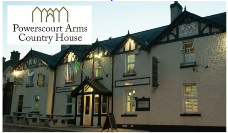
Day 2 & 3: Enniskerry Powerscourt Arms Country House