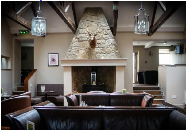
Day 2 & 3: Enniskerry Enniskerry Inn