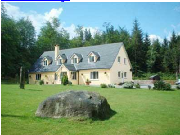
Day 3 & 4: Laragh/Glendalough Pinewood Lodge