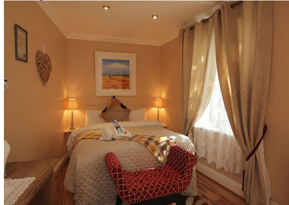
Day 1: Dublin Donnybrook Hall