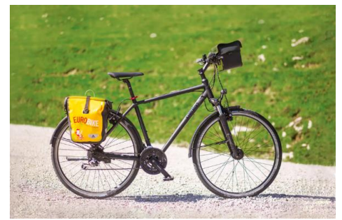
Bike PLUS with crossbar, €160