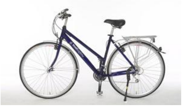
Ladies bike (for up to 5 ft. 3 in., and above)

The bike routes have a length of 20 to 60 km and lead through hilly or mountainous areas. Some uphill stretches are included. The roads are mostly asphalted. You can always choose to skip a bike tour and spend the time sunbathing on the ship instead. Helmets are required on all cycle tours. Helmets are available on board in limited number (on request).