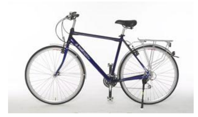
Men's bike (up to 6 ft, and above)

Please Note: Should you not want to be without your own saddle (without the post) or your own click pedals, please bring them with you and let your tour guide attach them to your rental bicycle.